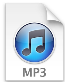
Jean Sibelius - Finlandia.mp3