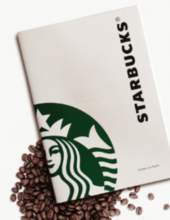
Copy: New Starbucks Braille Menus.