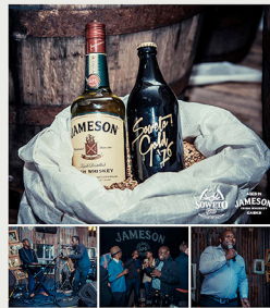
Soweto Gold '76 was launched on 12 May, 2016, with a poignant event at the Ubuntu Kraal Brewery in Orlando West. 40 years later, community leaders remembered the bravery of the youth of 1976.

There can be no better description for the youth of 1976. And there can be no better tribute to their brave contribution to freedom, than another contribution by their very hands.