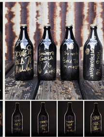
View the complete series of 76 personally branded bottles on Board 2.