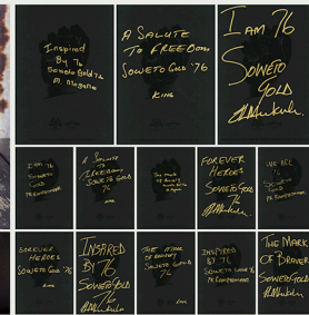
View the complete series of 76 hand-signed posters on Board 3.